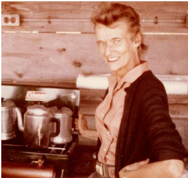
Concession under the grandstand at the Morris Half Mile Races,